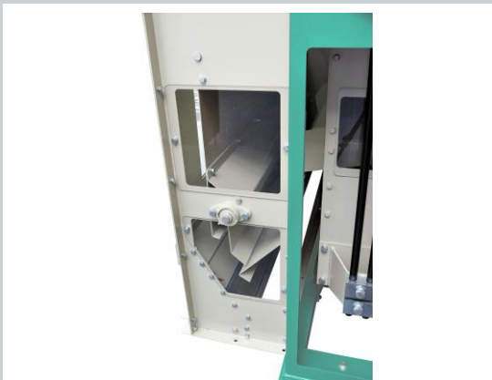
Isolation of metallic contamination An optional magnet in the vertical sifter removes metallic objects out of the main product.