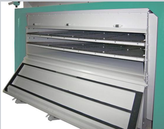
Easy maintenance / Fast screen change Optimum accessibility thanks to access from the front to change screens.