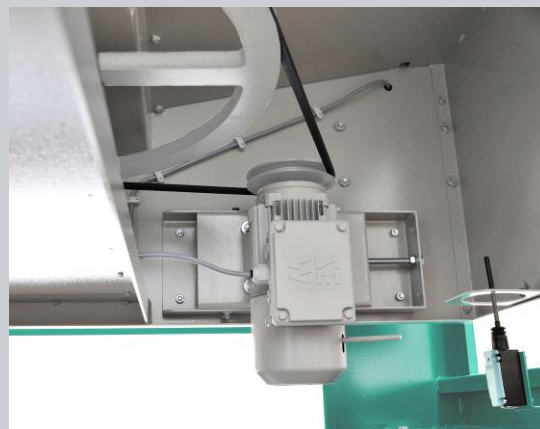
High system availability Safety equipment such as the oscillation monitor on the screen box provide protection against malfunctions.