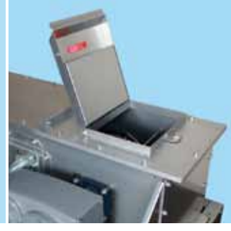
Pop up overloading flap/inspection hatch with safety switch.