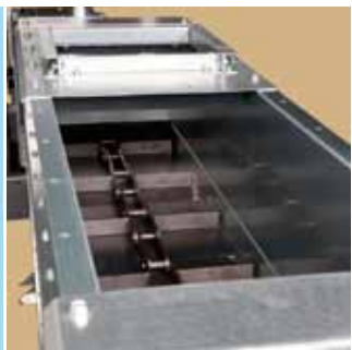
Self-regulating raised inlet.

GALVANISED ENERGY EFFICIENT SERVICE FRIENDLY COMPACT RELIABLE EASILY MOUNTED