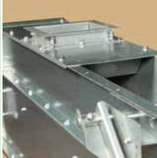
Self-regulating raised inlet.

GALVANIZED ENERGY EFFICIENT SERVICE FRIENDLY COMPACT RELIABLE EASILY MOUNTED