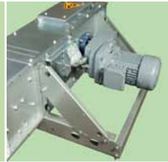
Direct-mounted gearbox motor with support frame.