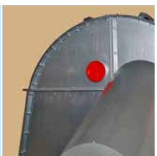
Elevator hood with aspiration connection.

GALVANISED ENERGY EFFICIENT SERVICE FRIENDLY COMPACT RELIABLE EASILY MOUNTED