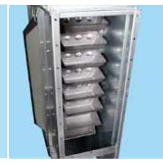
Antistatic bucket belt with steel buckets.