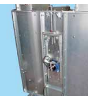
Belt tension in boot & speed monitor.