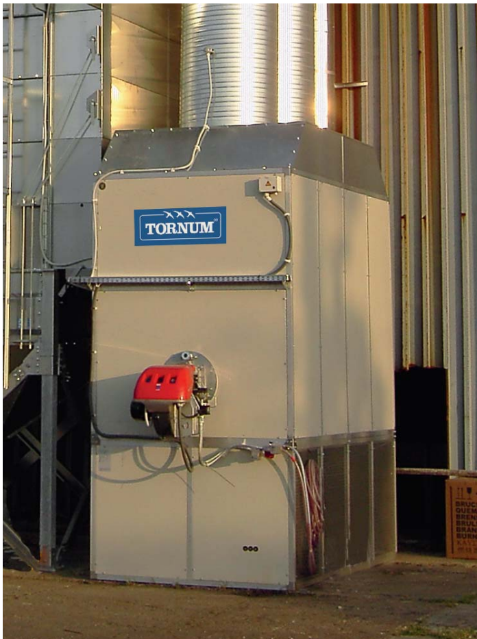
This model is available from 65 to 1318 kW. Furnaces over 1318 kW available on request.

A robust hot-air furnace for use indoors or outdoors. The frame is made of aluminum with walls built in a sandwich construction. The combustion chamber and heat exchange are made of stainless steel. The furnace has to be protected against the weather if being used outdoors.